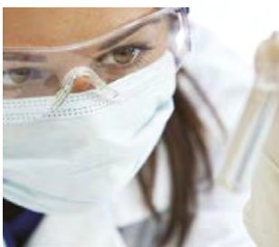
Healthcare and diagnostics