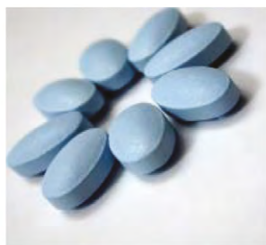
Pharmaceutical and biotech companies